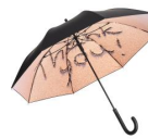
black/beach thx design