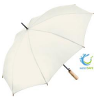
natural white wS