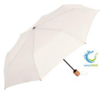
natural white wS