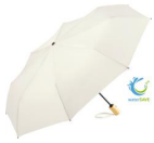
natural white wS