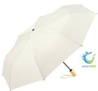
natural white wS